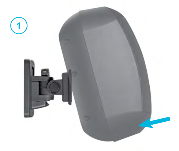
Push the loudspeaker on the click mount. Don't touch the grille.